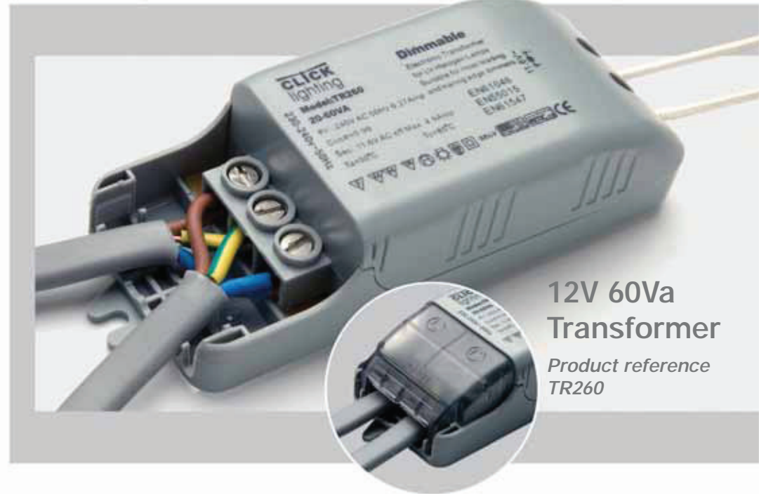
12V 60Va Transformer Product reference TR260