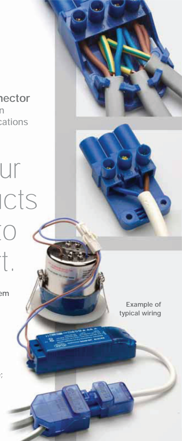
Example of typical wiring

Designed initially for lighting circuits to enable isolation of transformers, control gear etc whilst conducting the 'MEGA' 1000V Insulation Resistance Test.