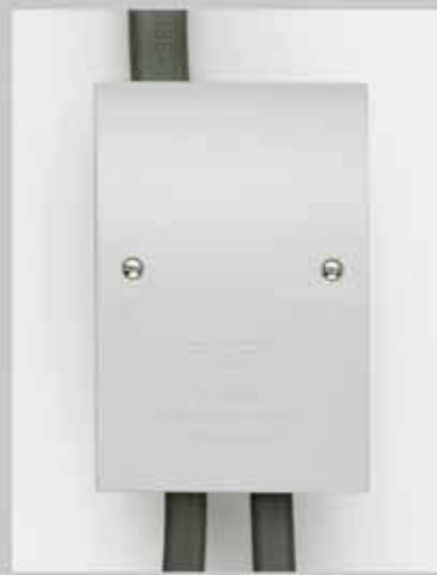
PRW217 45A Max. Dual Connection Plate