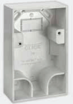
PRW218 Pattress Box for PRW217