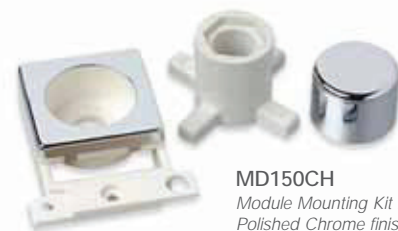
MD150CH Module Mounting Kit in Polished Chrome finish

You'd expect bright ideas from CLICK, simply because we talk to contractors. Your problems are our challenges. Our MINIGRID Dimmer Module Mounting Kit fits all CLICK Minigrid plates, and its nut runner makes installation a breeze.